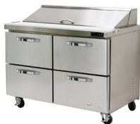
BLPT48-D4-HC / BLPT60-D4-HC