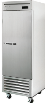
BSR23-HC / BSF23-HC