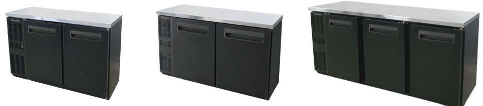
BNB-48BT-HC BNB-60BT-HC BNB-72BT-HC