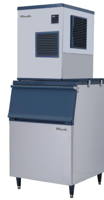
BLMI-500A & BLIB-500S