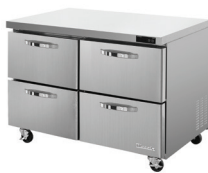
BLUR48-D4-HC / BLUR60-D4-HC