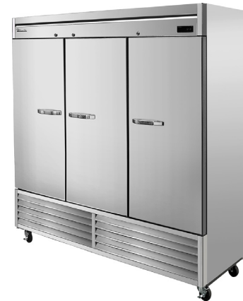
BSR72-HC / BSF72-HC