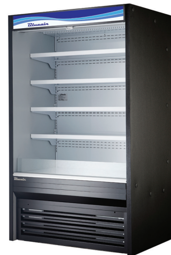
BOD-60S / BOD-72S