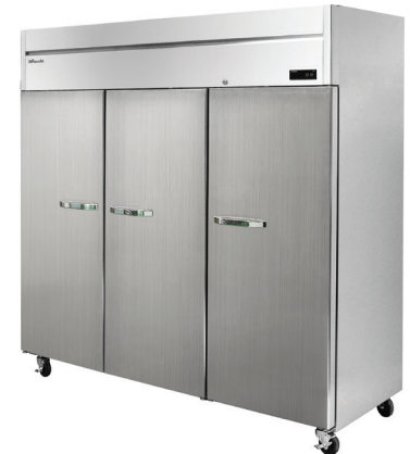
BSR72T-HC / BSF72T-HC