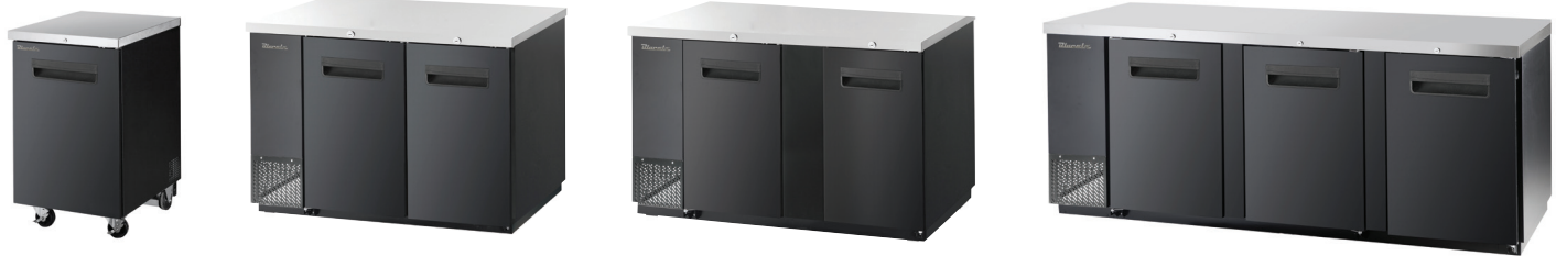
BBB23-1B(S)-HC BBB59-2B(S)-HC BBB69-3B(S)-HC BBB90-4B(S)-HC