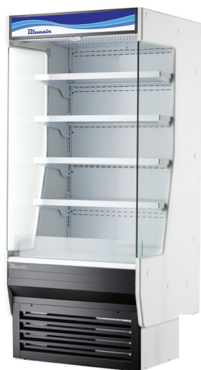
BOD-36G / BOD-48G