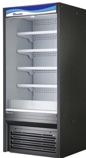
BOD-36S / BOD-48S