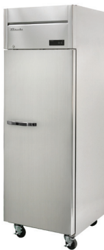
BSR23T-HC / BSF23T-HC