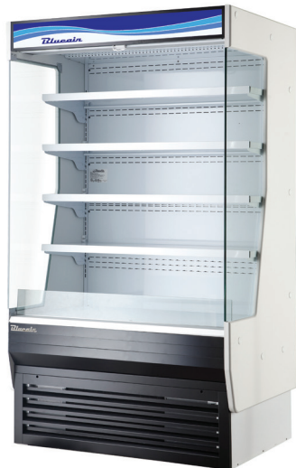
BOD-60G / BOD-72G