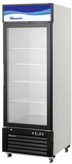
BKGM12-HC BKGM14-HC BKGM23-HC