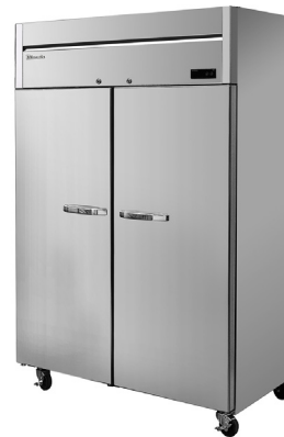
BSR49T-HC / BSF49T-HC