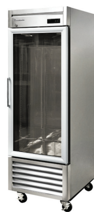
BSR23G-HC / BSR23GP-HC