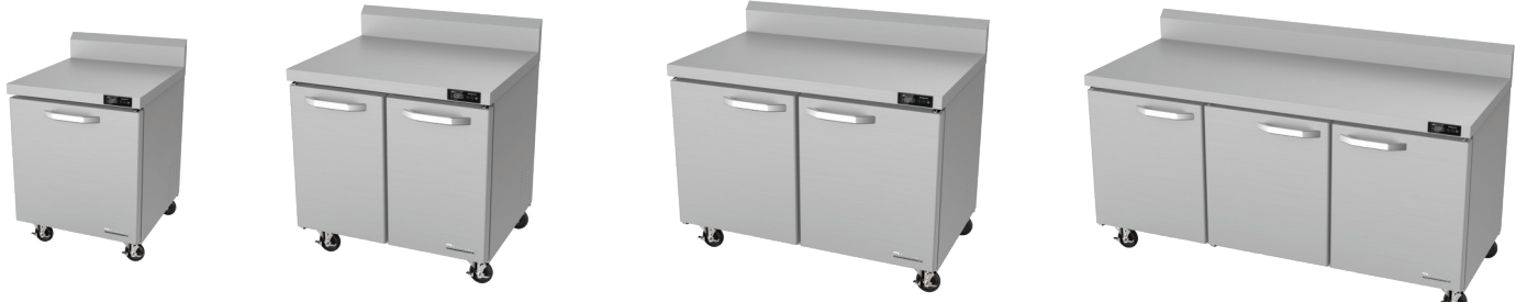
BLUR28-WT-HC / BLUF28-WT-HC BLUR36-WT-HC / BLUF36-WT-HC BLUR48-WT-HC / BLUR60-WT-HC / BLUF48-WT-HC / BLUF60-WT-HC BLUR72-WT-HC