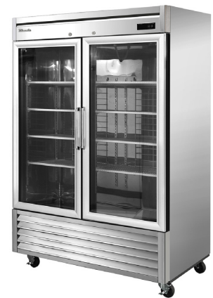
BSR49G-HC / BSR49GP-HC