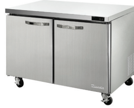
BLUR36-HC / BLUF36-HC BLUR48-HC / BLUF48-HC BLUR60-HC / BLUF60-HC