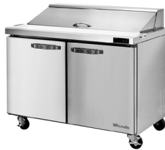
BLPT48-HC / BLPT60-HC