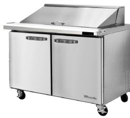
BLMT36-HC / BLMT48-HC