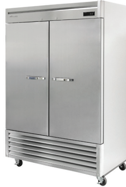
BSR49-HC / BSF49-HC