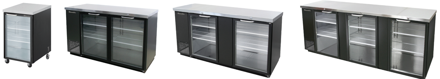
BBB23-1BG(SG)-HC BBB59-2BG(SG)-HC BBB69-3BG(SG)-HC BBB90-4BG(SG)-HC